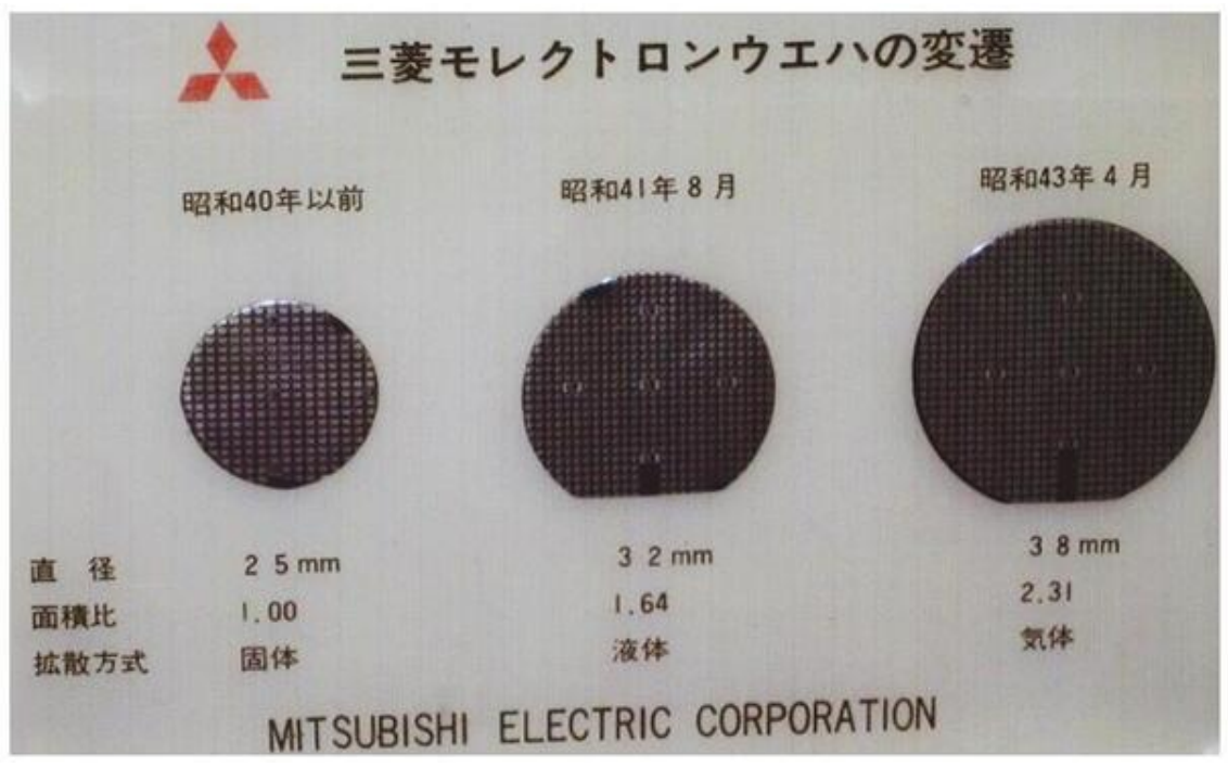
Fig.2: Evolution of Mitsubishi Molectron Wafers