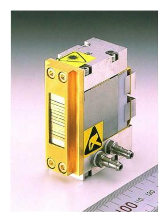
Fig.3: Laser stack (stacking laser bars)

(Single-striped high-power lasers are arranged in one dimension)