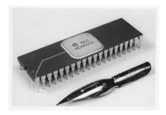
Figure 1 HD46505 CRTC